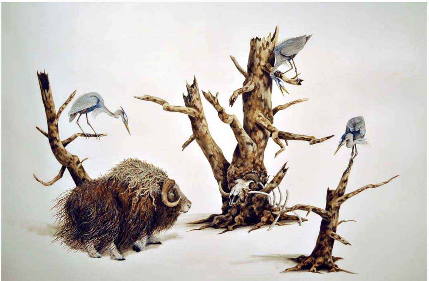
RYAN MCLENNAN, THE OTHER, ACRYLIC AND GRAPHITE ON PAPER, 30 X 46½"