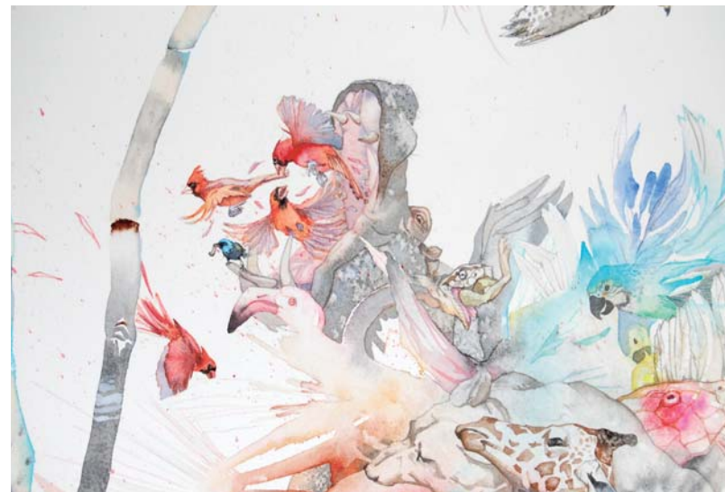
Laura Ball, Tree of Life (detail), watercolor on paper