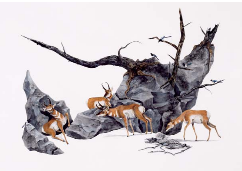
Ryan McLennan, The Witch , acrylic and graphite on paper, 37 x 52"