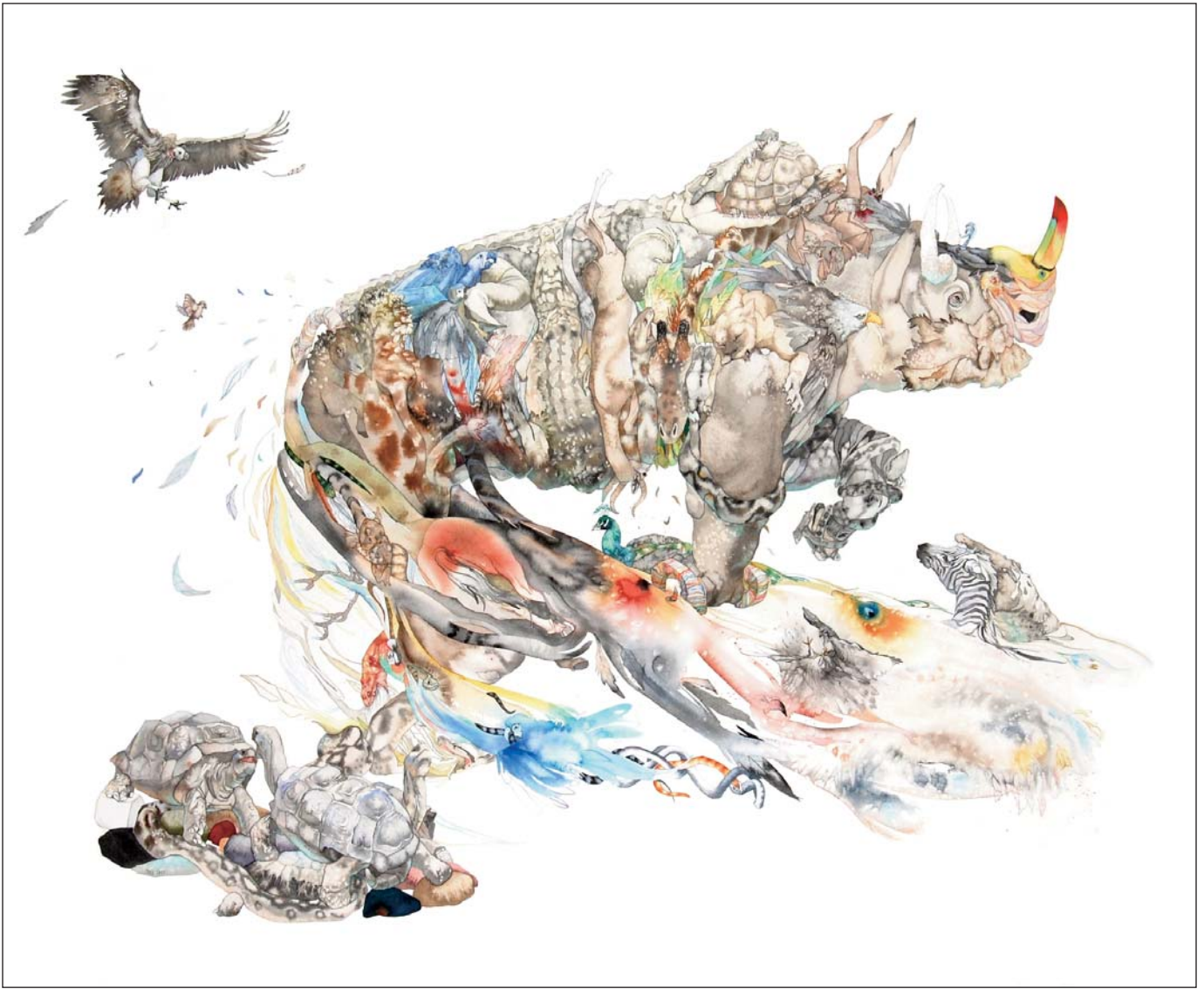
Laura Ball, Growing Pains , watercolor on paper, 33 x 51½"